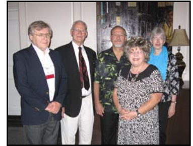
A fine group of ADMers from Kansas, Missouri and the Kansas City area.