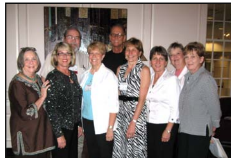
This fine group from Oklahoma will welcome you back to the Sooner State in 2012.