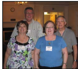
Those from Arkansas and Louisiana region.