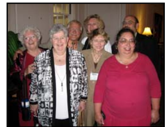
Ohio was well represented.