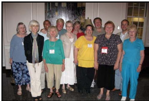
A fine group from Indiana