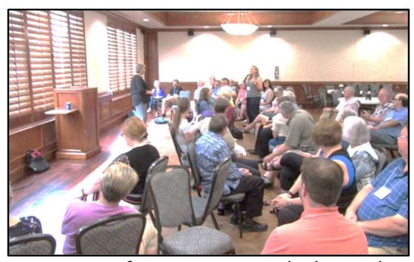
Sessions for Learning and Sharing!