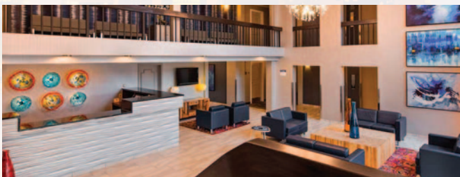
OUR HOST HOTEL, BEST WESTERN KIRKWOOD INN