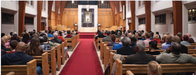
SANCTUARY, WEBSTER GROVES CHRISTIAN CHURCH