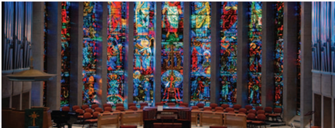
SANCTUARY, FIRST PRESBYTERIAN CHURCH OF KIRKWOOD