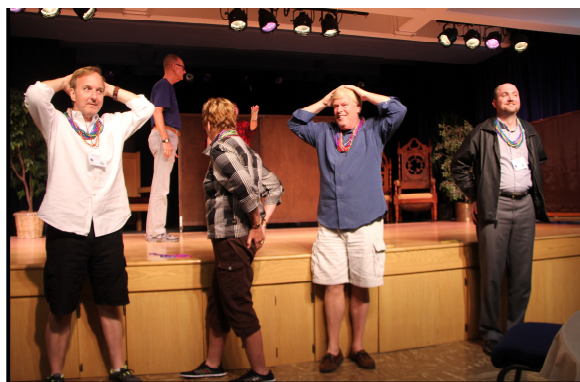
Bunches of fun!!!