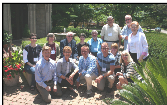
Those from Illinois welcomed us to the Land of Lincoln with a great conference at Central Christian in Decatur, and a wonderful worship experience at Westminster Presbyterian Church, an afternoon visiting the Lincoln sites and a glorious carillon experience at Washington Park all in Springfield.