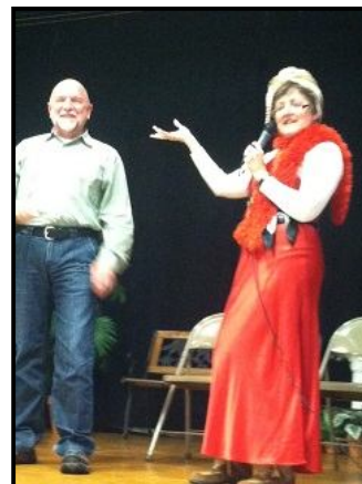
Even Lola will be in Decatur!!