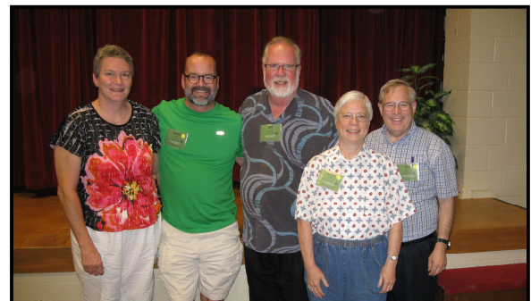
Surely the number from Iowa and Illinois will grow, since we'll be in their backyard this year in Decatur and Springfield.