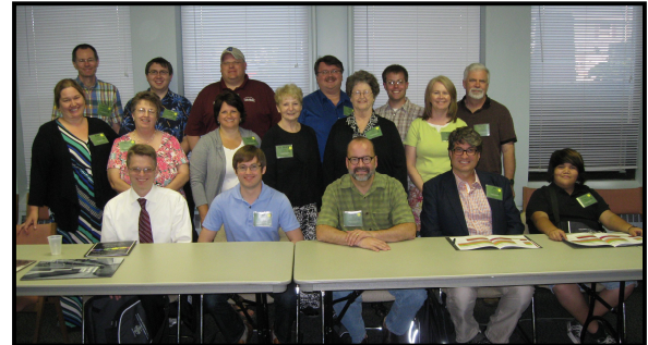
Here's hoping that ALL of the 2013 First-timers will become full-fledged ADMers by attending the 2014 conference.